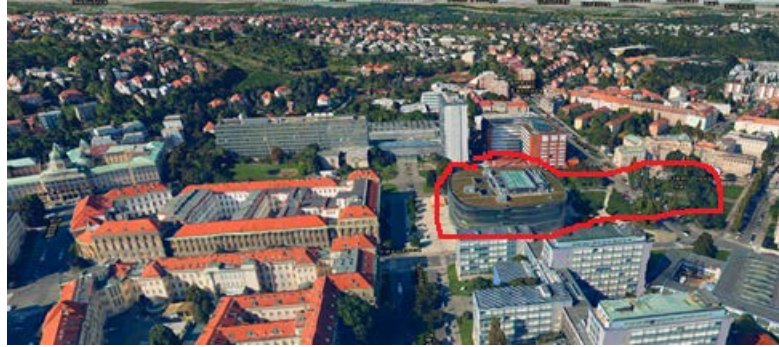
Figure 2: Locality of measurement in CTU in Prague campus – red contour.

Time [hour, minute, day], Temperature [°C] and Humidity [%] in distances 0.3m, 1m, 2m from the surface of the terrain, Coming Sun radiation [W/m 2 ], Reflected Sun radiation [W/m 2 ], Velocity of the wind (in determined direction) [m/sec]. (All values of quantities were related to time.)